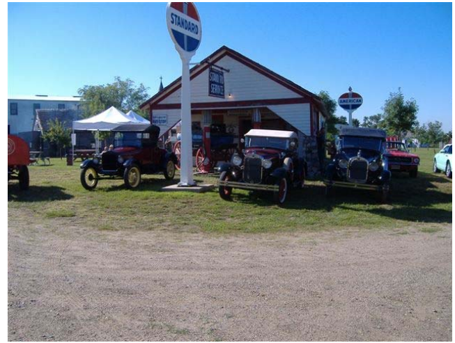
Cars at the gas station