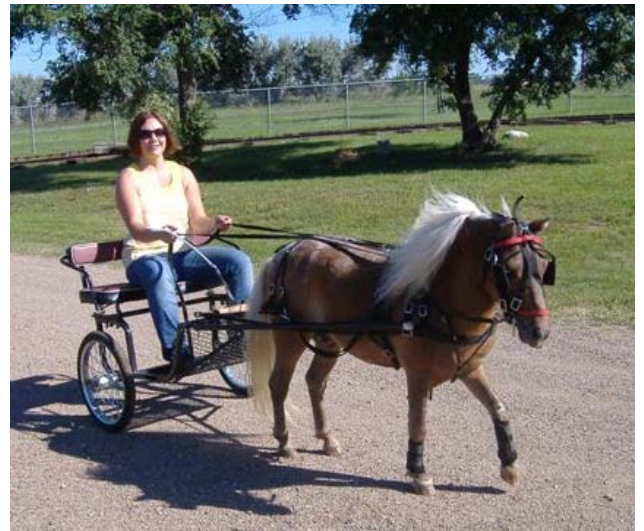
Real horse power!