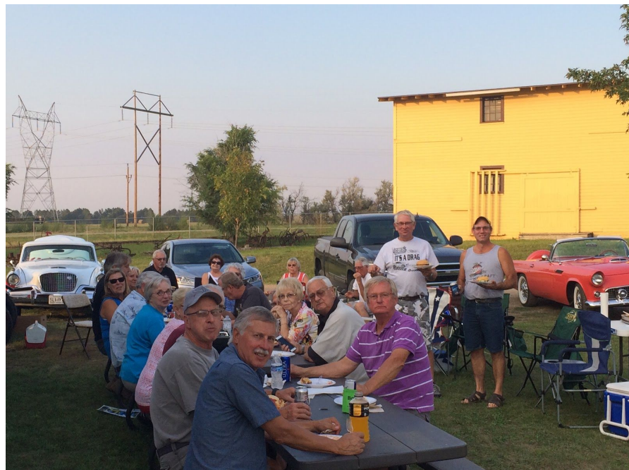
Cookout for September dinner cruise.