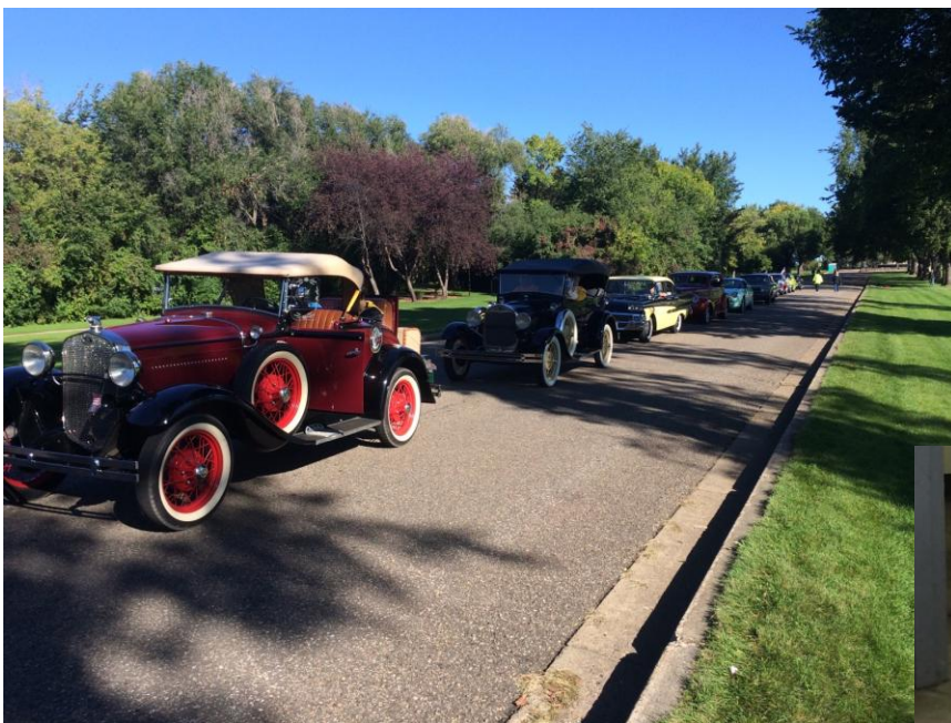
Autumnfest Parade lineup