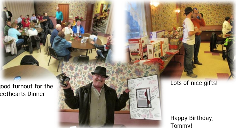
A good turnout for the Sweethearts Dinner

The next meeting will be March 20 th at 7:30pm at Riverwood RV.