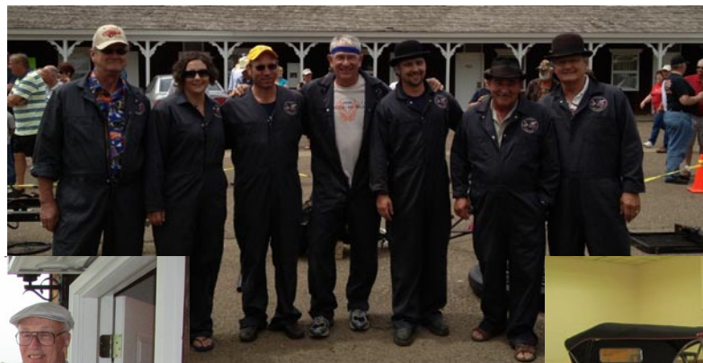
T Build Team