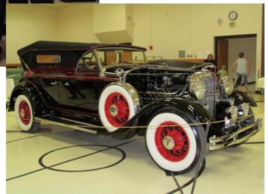
Centerpiece Car 1931 Mark K Lincoln