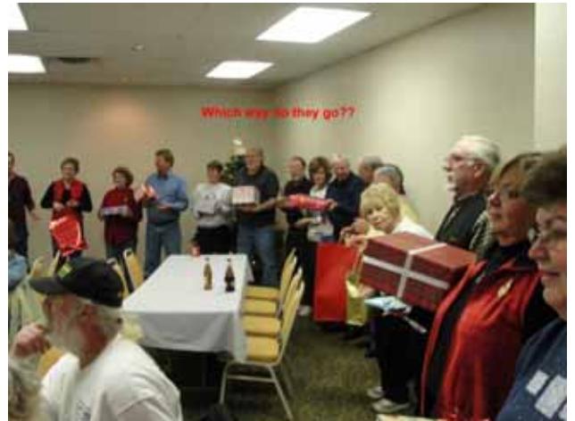
Which way do they go??