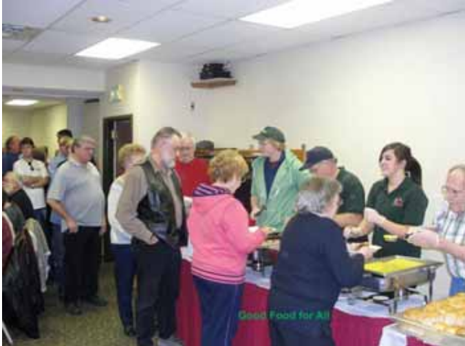
Good Food for All