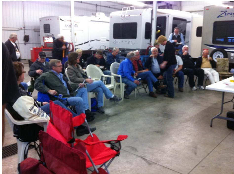
Good turn out at the March PAC meeting