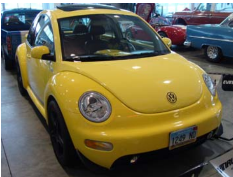
Medcenter One's Choice - Keith Schmaltz's 2003 VW Beetle "Vorche"